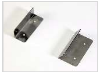
Metal Brackets Metal Brackets, 90 degree and 45 degree for mounting stairlights where there are no risers SL 534