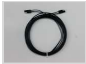
1' to 50' Extension Harness Available in the following: 1': EC 5 1 5': EC 5 5 15'': EC 5 24 10': EC 5 10 2': EC 5 2 15': EC 5 15 3': EC 5 3 20': EC 5 20 4': EC 5 30': EC 5 30