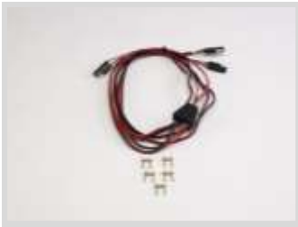
Postlight to Stairlight Link "T" harness with 2-5' leads 1-12" lead from "T" to connect to stairlighting wiring harness 5 wire staples DL SL Link