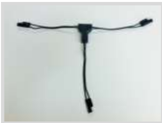
Y-Connector Three 6" leads to split extension run in two directions. EC 5 Y